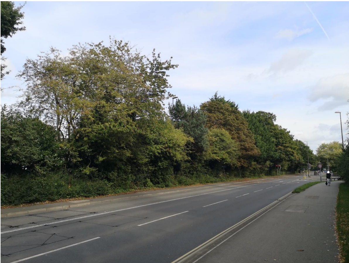
Photo showing protected trees viewed from Haslett Avenue East